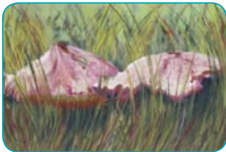
You see mushrooms, I see Marsala!

“My background comes from 15 years as a Designer with General Motors in Detroit. My degree is in Auto Body Design-Styling Specialty. But I have learned so much more from