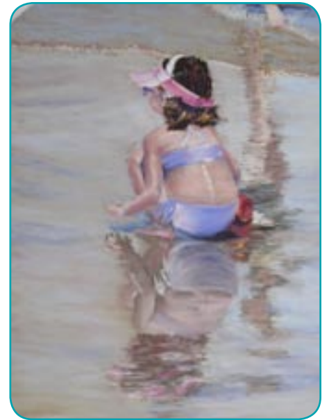
Always Watching Over You