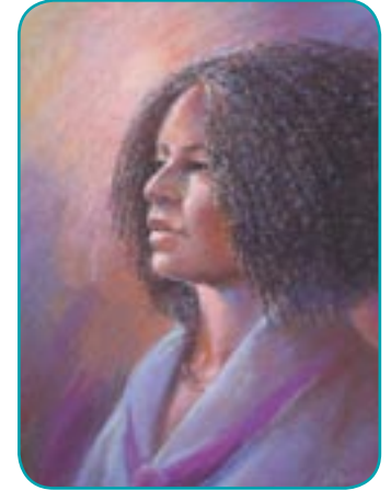
A Woman of Color