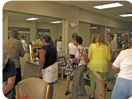
A flurry of voting for Artist of the Month

4. The first Artist of the Month competition was a great success. Look for the photos of the winners