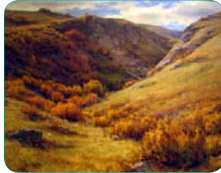
Clyde Aspevig's "October in Montana" (my personal favorite of the contemporaries work)