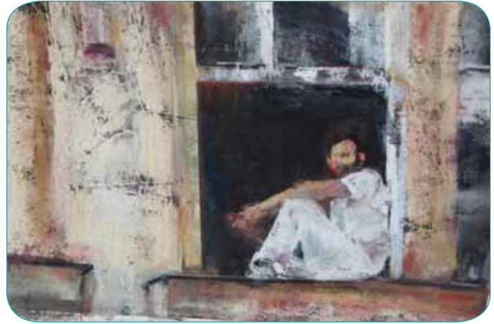
First Floor by Cheri Saffro