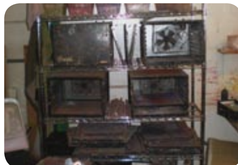
These are the ovens in which the pastels are baked.