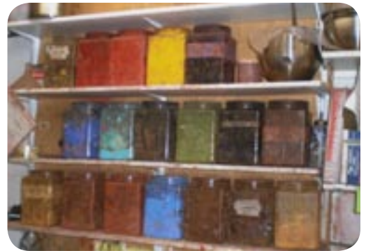
Here are the rows of colours which will eventually become pastels.