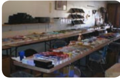
An overall view of the studio.