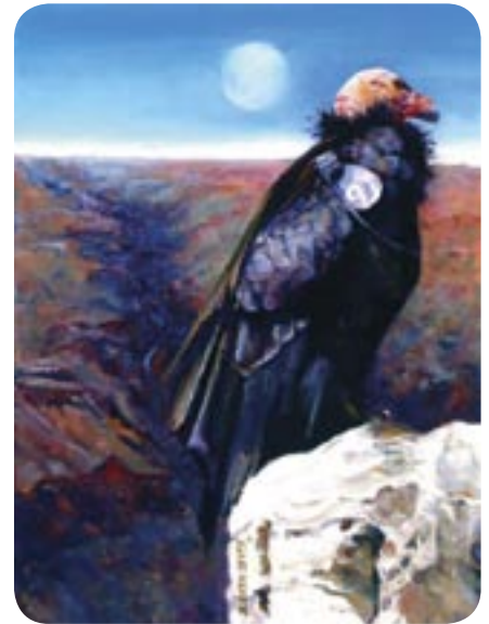
Majesty by Judith Spitz

from September 16th to October 14th. There will be a free demonstration sometime before that. For more information call Brio at 480