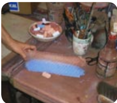
After the ingredients are measured, they are mixed together.