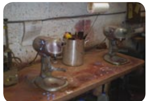
Once the pastels are hard, the rough edges are smoothed off with this tool.