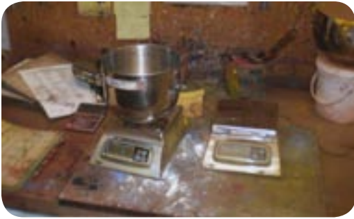
The ingredients are measured out on these scales.